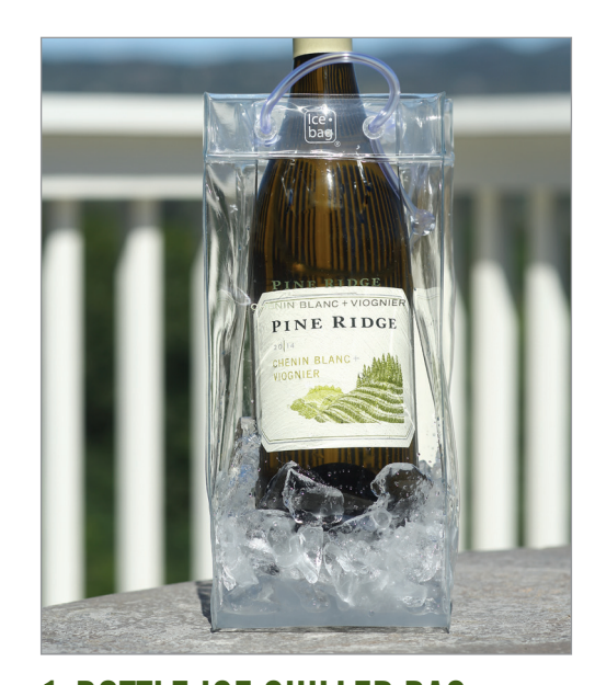
1-BOTTLE ICE CHILLER BAG Keeps bottles cool and refreshing

Chenin Blanc + Viognier is a unique white blend that combines the crisp, honeyed fruit of Chenin Blanc with the plush body, light floral aromas and juicy stone fruit of Viognier for a wine that is both sophisticated and easy to enjoy.