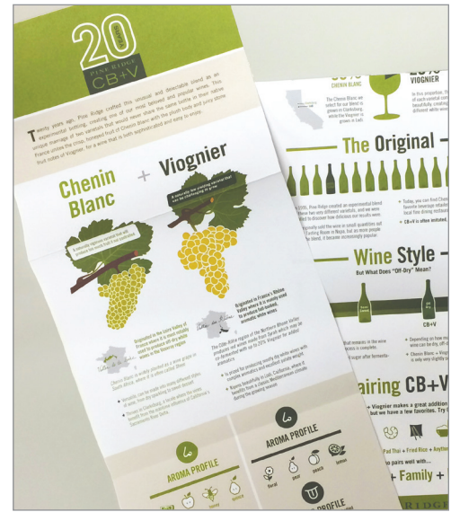
20TH ANNIVERSARY INFOGRAPHIC POSTER

Packed with information on the history and style of CB+V